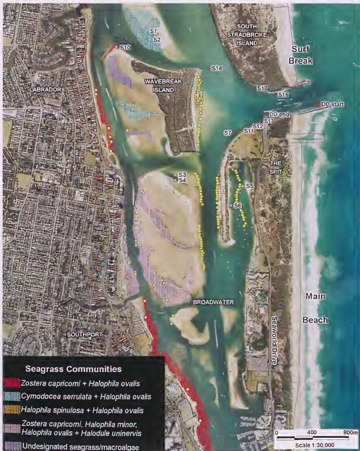
FIG. 1. Habitat map of seagrass communities in the Southport Broadwater.